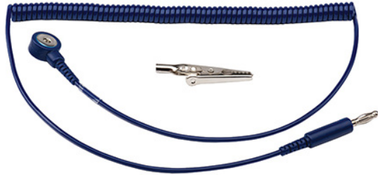
Product# 8101 6 per pack