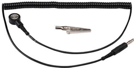
Product# 8107 6 per pack